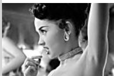
Las Vegas Man Finds An Old Camera In His Attic With Pictures Historian Insight