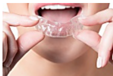
The True Cost of Braces vs. Invisible Aligners SmileDirectClub