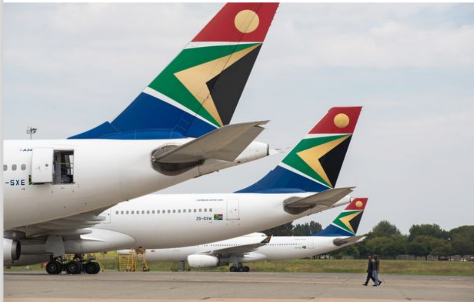
The logo of South African Airways sits on the tailfins of Airbus Group NV A340, left, and A330-200 aircraft parked at O.R. Tambo International airport in Johannesburg on February 24, 2015.