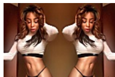
Phwoar! Khanyi Mbau flaunts banging body in G-string Entertainment