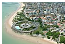
12 Most Dangerous Cities in The World to Travel DailyForest