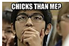
16 Savage Memes That'll Leave You Dying From Laughter HorizonTimes