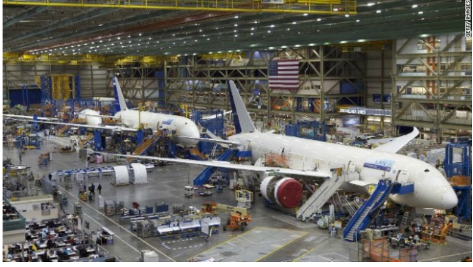
Boeing 787 Dreamliners at the assembly plant in Everett, Washington, U.S. At 98 acres, it's the largest building in the world by volume and gets 110,000 visitors a year.

U.S.-based aerospace and defense company Boeing International plans to open two new offices in Johannesburg, South Africa and Nairobi, Kenya, the company said Tuesday in a statement.