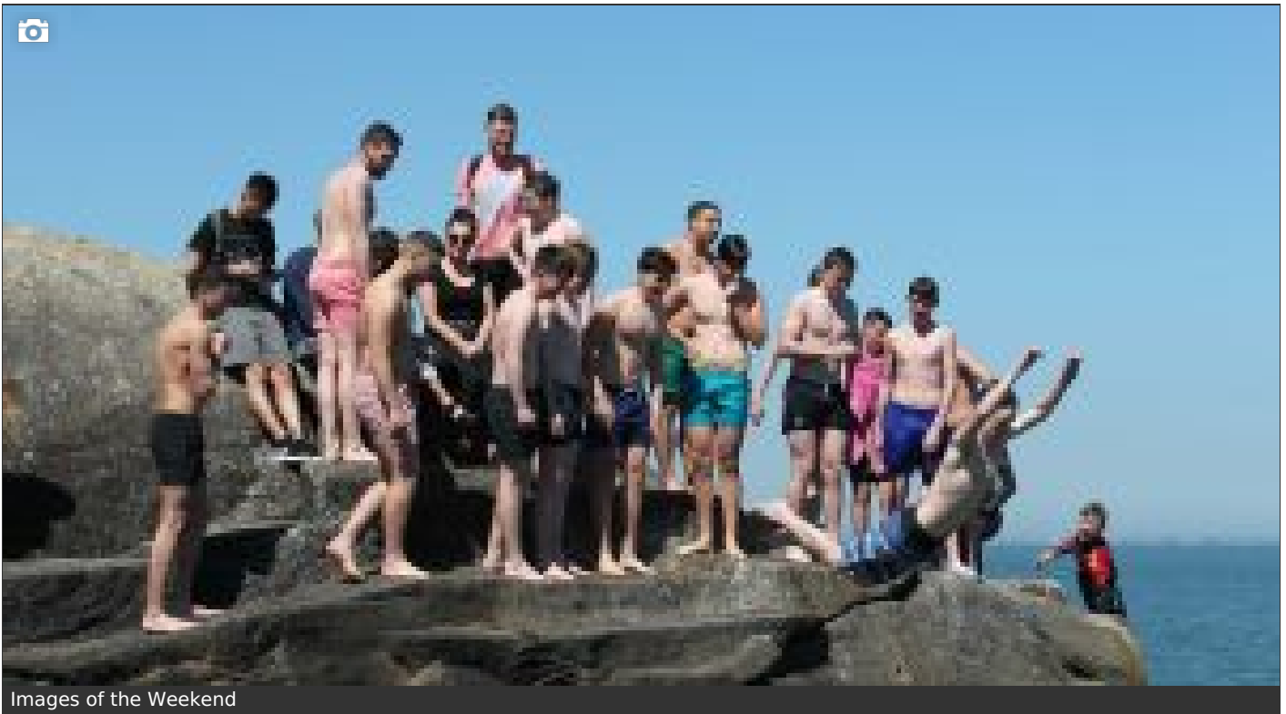
Images of the Weekend