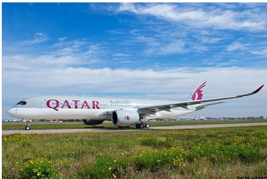
Qatar Airways Airbus A350

It may be heavily subsidized and it may have a CEO who is not widely loved, but today Qatar Airways deserves our praise.