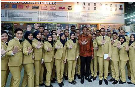
29 Malaysian youth...