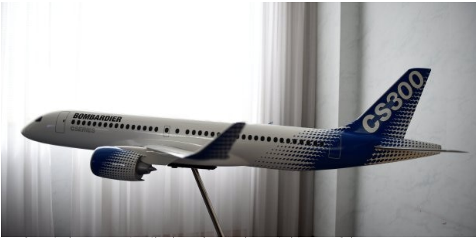
US slaps duties on Bombardier jets after Boeing subsidy complaint