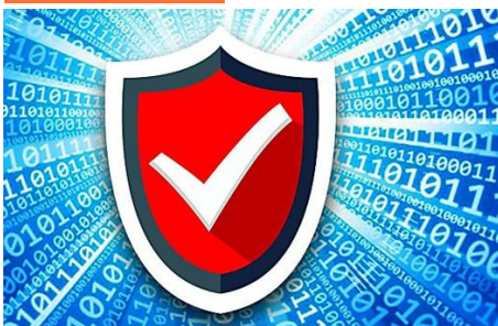
The Top 5 Free Most...