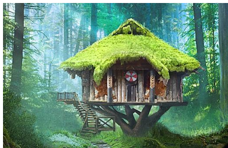
Play this for 1 minute...