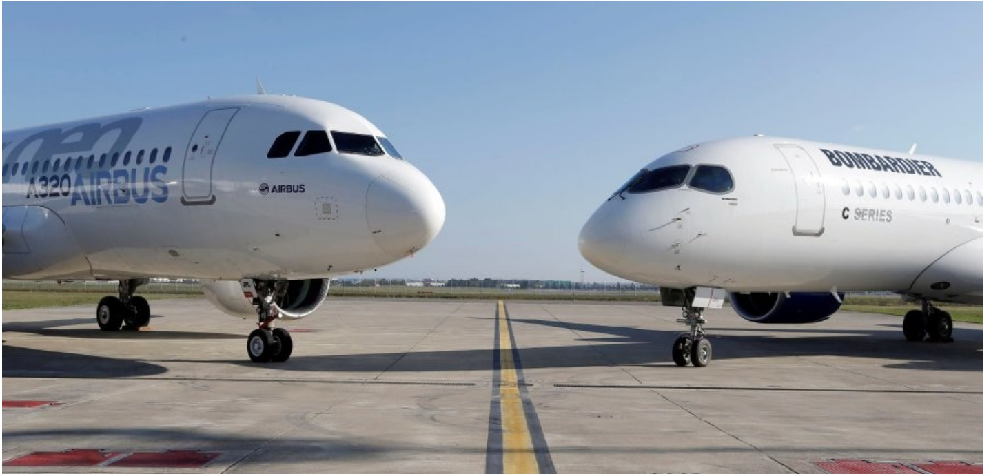
An Airbus A320neo aircraft and a Bombardier CSeries aircraft are pictured during a news conference to announce a partnership between Airbus and Bombardier on the C Series aircraft programme, in Colomiers near Toulouse, France, Oct 17, 2017.