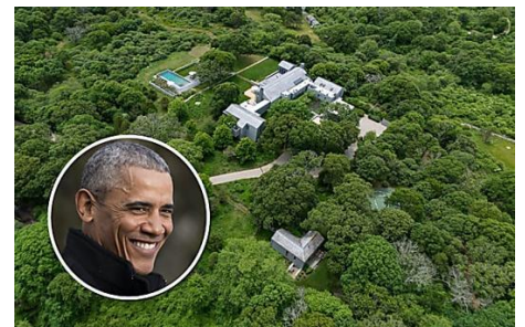
Six Presidential Properties...