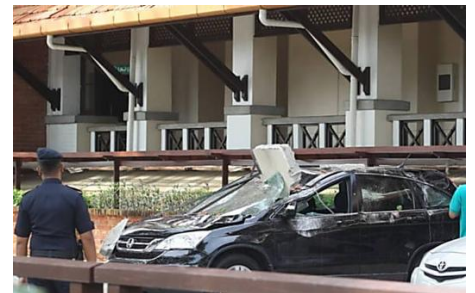
Port Dickson hotel...