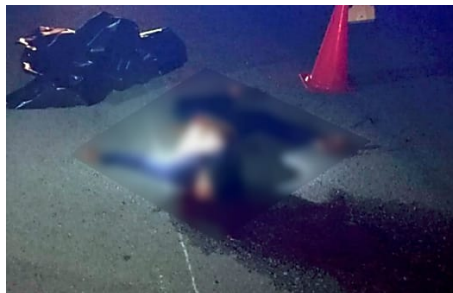
Teen killed in motorcycle...