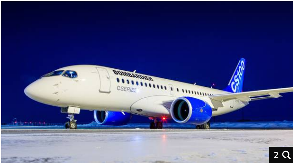
A C Series jet