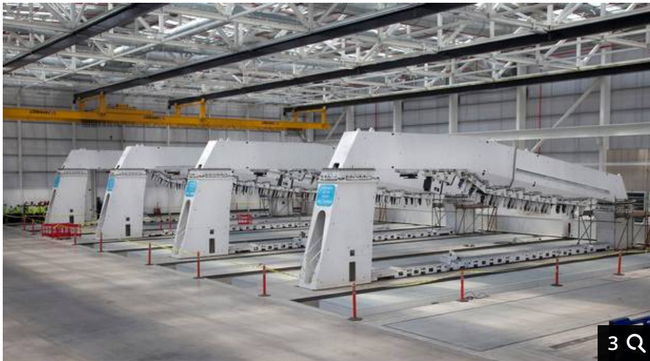
Bombardier's wing factory in Belfast