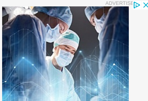
Oncologists Are Freaking Out After True Cause of Cancer Is Released Natural Health Solutions

The French and British governments have reported the deaths of nine of their nationals.