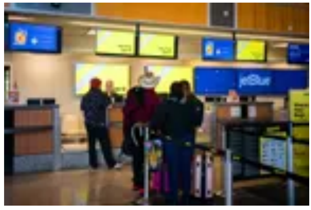
AUSTIN, TEXAS - FEBRUARY 12: Customers wait to be assisted at a Spirit Airlines check-in counter at... [+]

By deferring these planes, Spirit Airlines buys itself some time to strengthen its finances after the merger with JetBlue fell through.