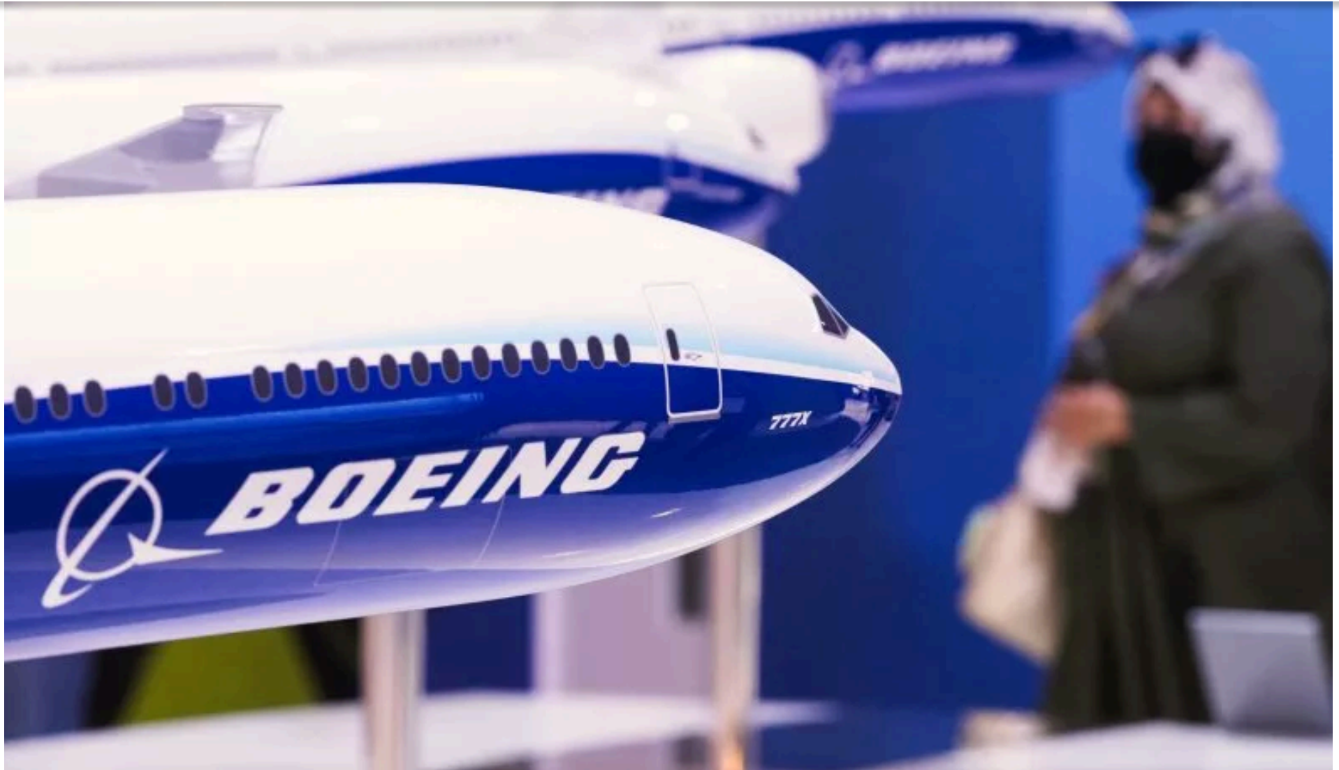
A woman walks by models of Boeing Co. aircraft, including the manufacturer's Boeing 777X, at the Dubai Air Show in Dubai, United Arab Emirates, Wednesday, Nov. 17, 2021.