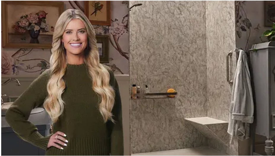
Here's How Much A 1-Day Walk In Shower Costs In Maryland