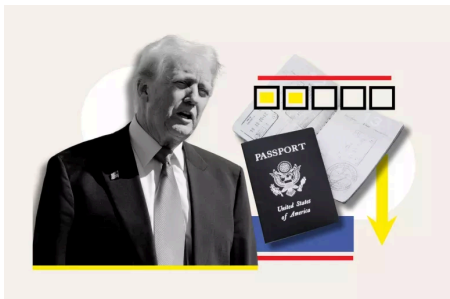
Donald Trump's Approval Rating Over