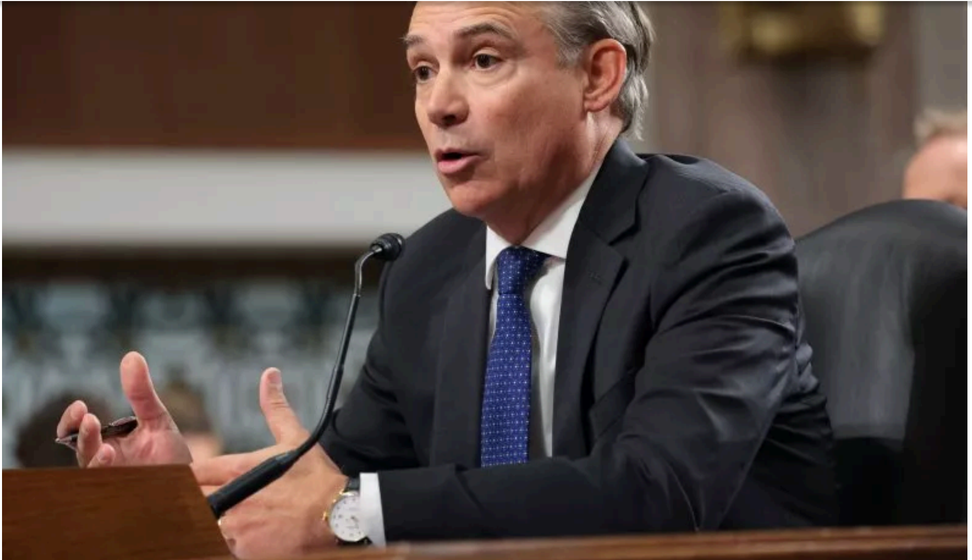
President and CEO of Boeing Kelly Ortberg testifies before the Senate Commerce, Science, and Transportation Committee in the Dirksen Senate Office Building on April 02, 2025 in Washington, DC.