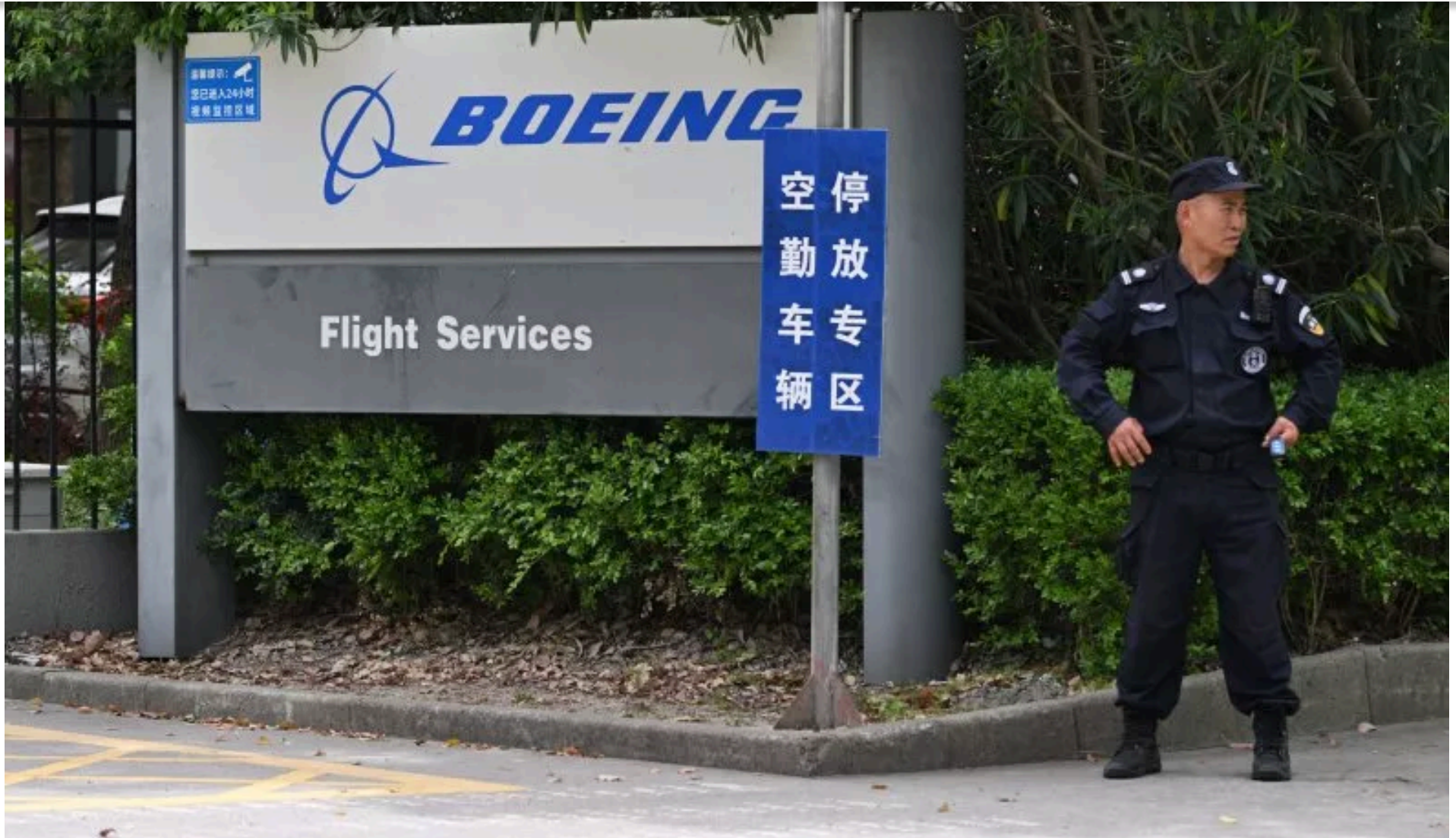
A security guard stands at the entrance of the Boeing flight services facilities near the Shanghai Pudong International Airport in Shanghai on April 16, 2025.