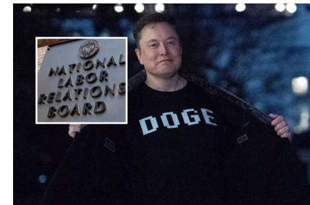
DOGE Whistleblower Says He Was Stalked and