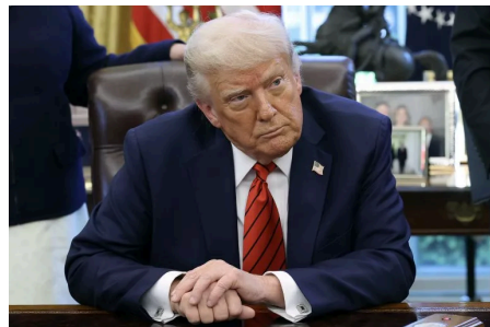
Trump Hints at Tariff Pause, TikTok Deal on