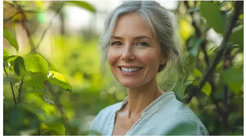
Top 5 Wealth Management Firms In The United States