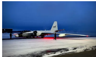
NASA and NOAA Discover Organic Nanoparticles in Lower Stratosphere