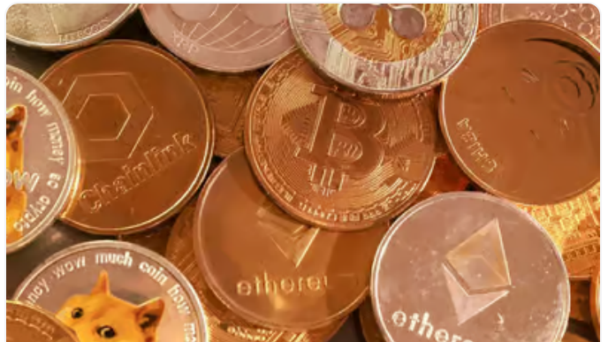
Greece to tax gains from crypto, sources say