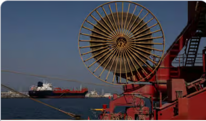
Analysis-Global oil inventories depleted, next price spike could roil...