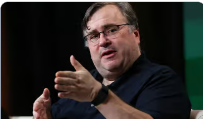
LinkedIn co-founder Reid Hoffman to step down from Microsoft's board