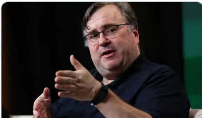
LinkedIn co-founder Reid Hoffman to step down from Microsoft's board