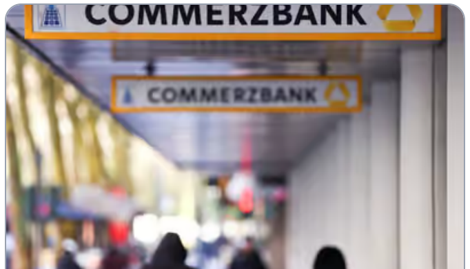
Commerzbank says UniCredit tender acceptances reach 7.85% in bid battle