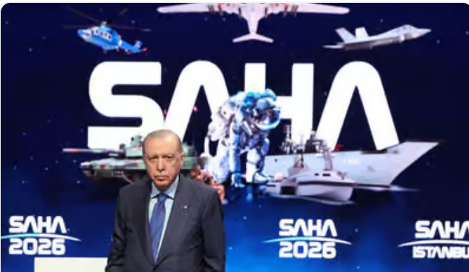
Analysis-Turkey targets more defence sales as West rearms, alliances shift