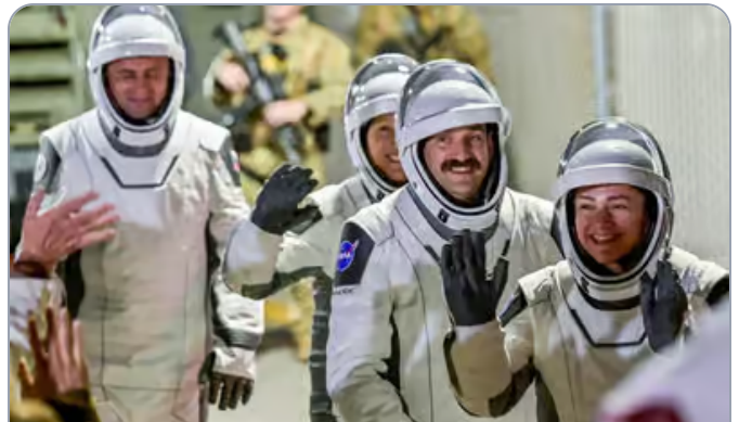
Factbox-Who is aboard the International Space Station during t...