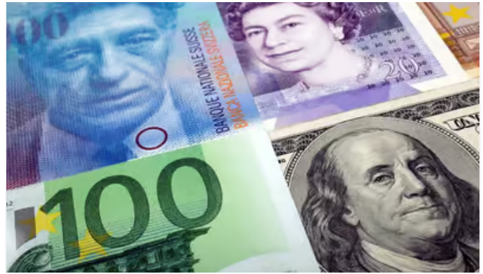
Private credit roundup: Private equity catches the cold