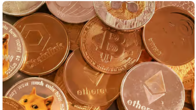
Greece to tax gains from crypto, sources say