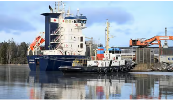
Finland says four people suspected in subsea cable breach