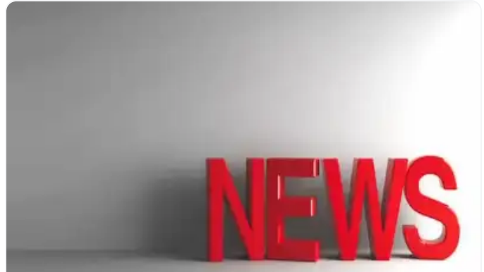
Russia plans to launch its smaller version of Starlink next year