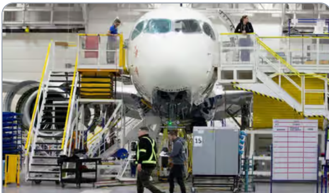
Airbus in limbo over early launch of larger A220, sources say