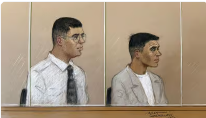
Romanians convicted of stabbing journalist in UK, prosecutors say they...