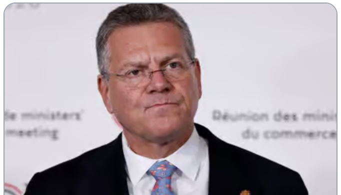
EU weighs rules to cut reliance on China through broader supply chains