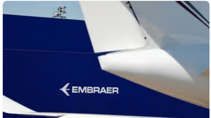
Embraer takes off after Azorra deal lifts E2 program past 500 orders