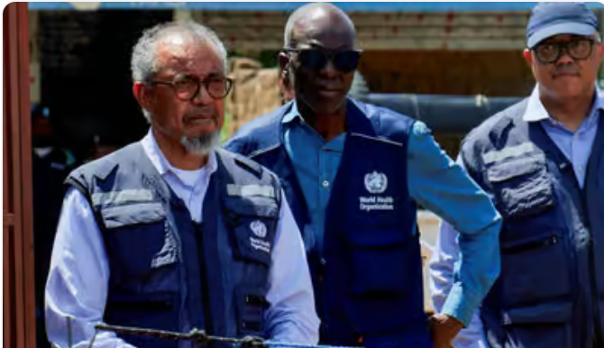
WHO launches $518 million plan to curb Africa Ebola outbreak

Explore more articles in the Finance category