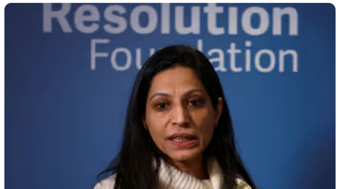
Hard to give rate guidance due to oil price uncertainty, BoE's Dhingra says