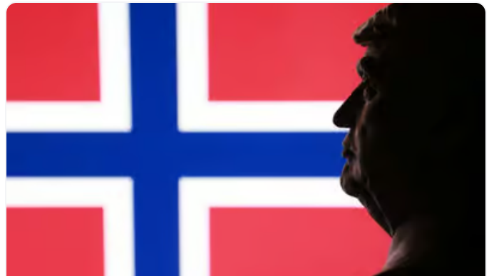
Norway rejects US claim on forced labour, opposes tariffs