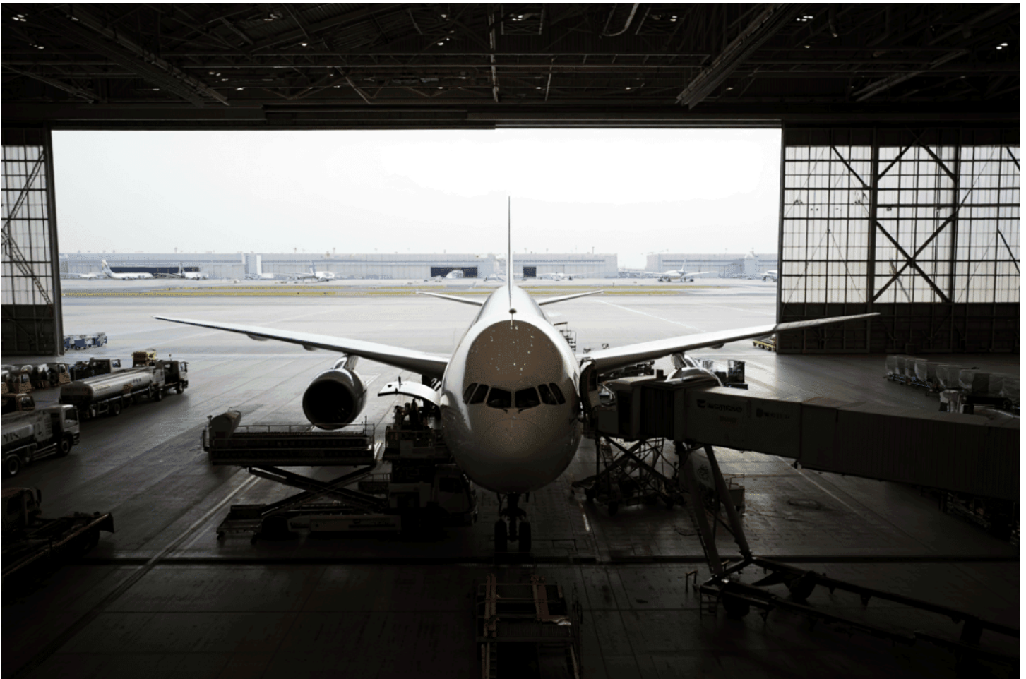
© Emirates removes A380 from 6 routes in June amid demand shift

Published on 8 June 2026 at 6:15 pm Written by Chris Martin Reading duration : 2 minutes · read 26 times